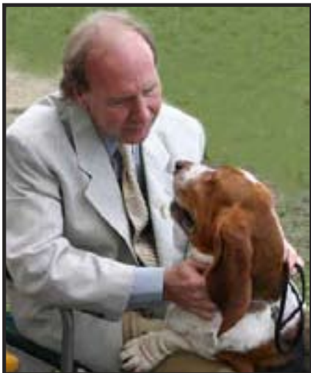
Between turns in the ring