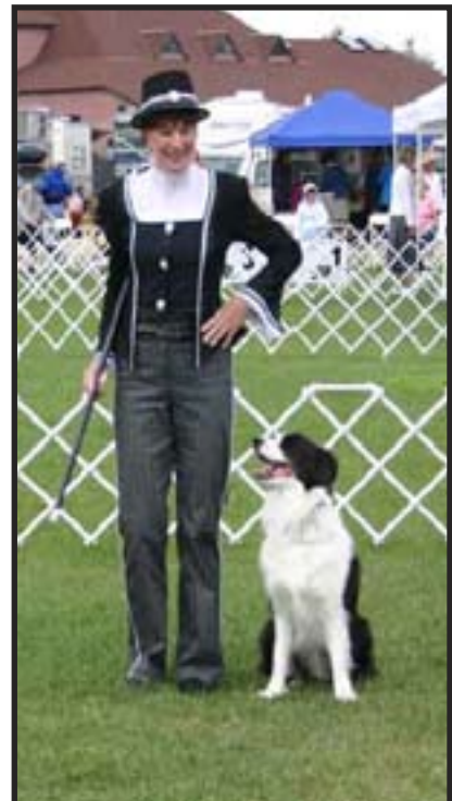
Dance team prepares for their routine at the HRKC show