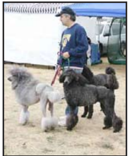
A gaggle of poodles waits its turn.