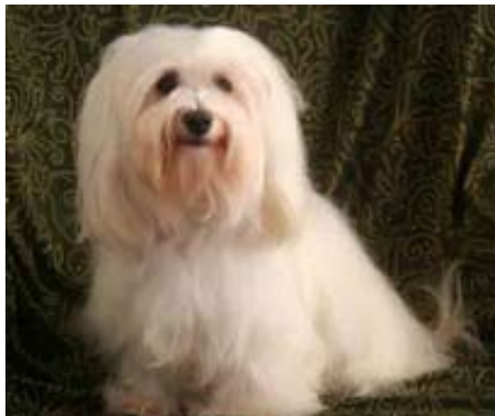
CH Isabella Tisza

What is interesting to note is that Dorothy Goodale and some friends split