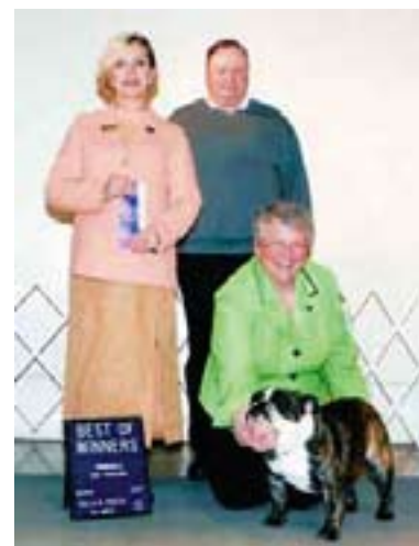
Ch. BayVeiv Jolly Roger x BayVeiv Shelbi Rose