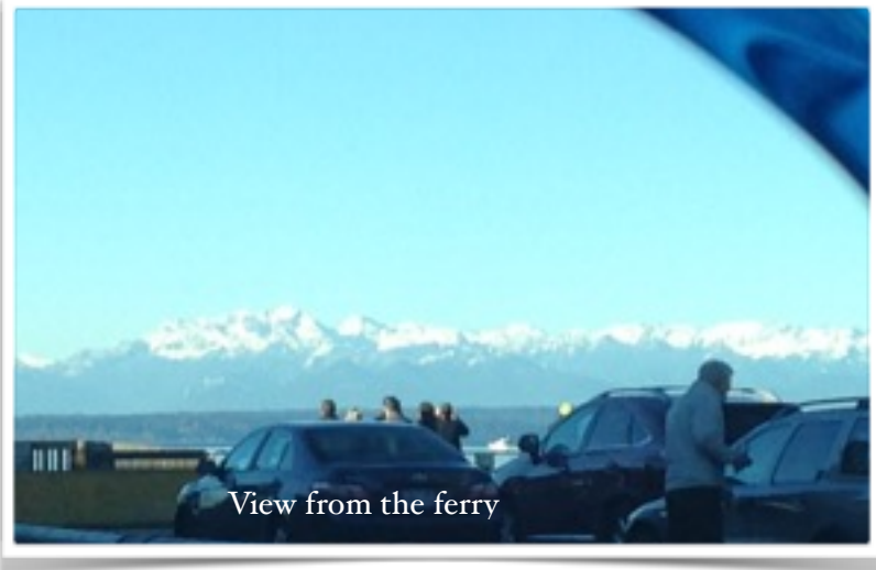
View from the ferry