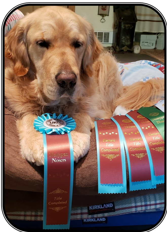
KEEPER and his beautiful Nosework Ribbons