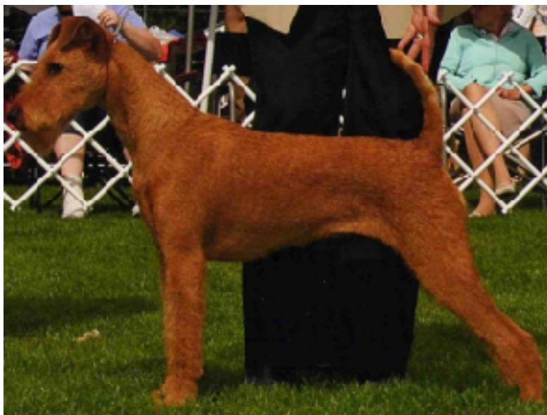
Kenna (Ch Kincora's Chinook wind) after winning a 4 pt major at Marymoor Park ATCWW Show

Send items to hrkcnews@yahoo.com , or via the link on the Contact Us page. Be sure to include your name, dog names (and, if more than one dog, identify who is who please).