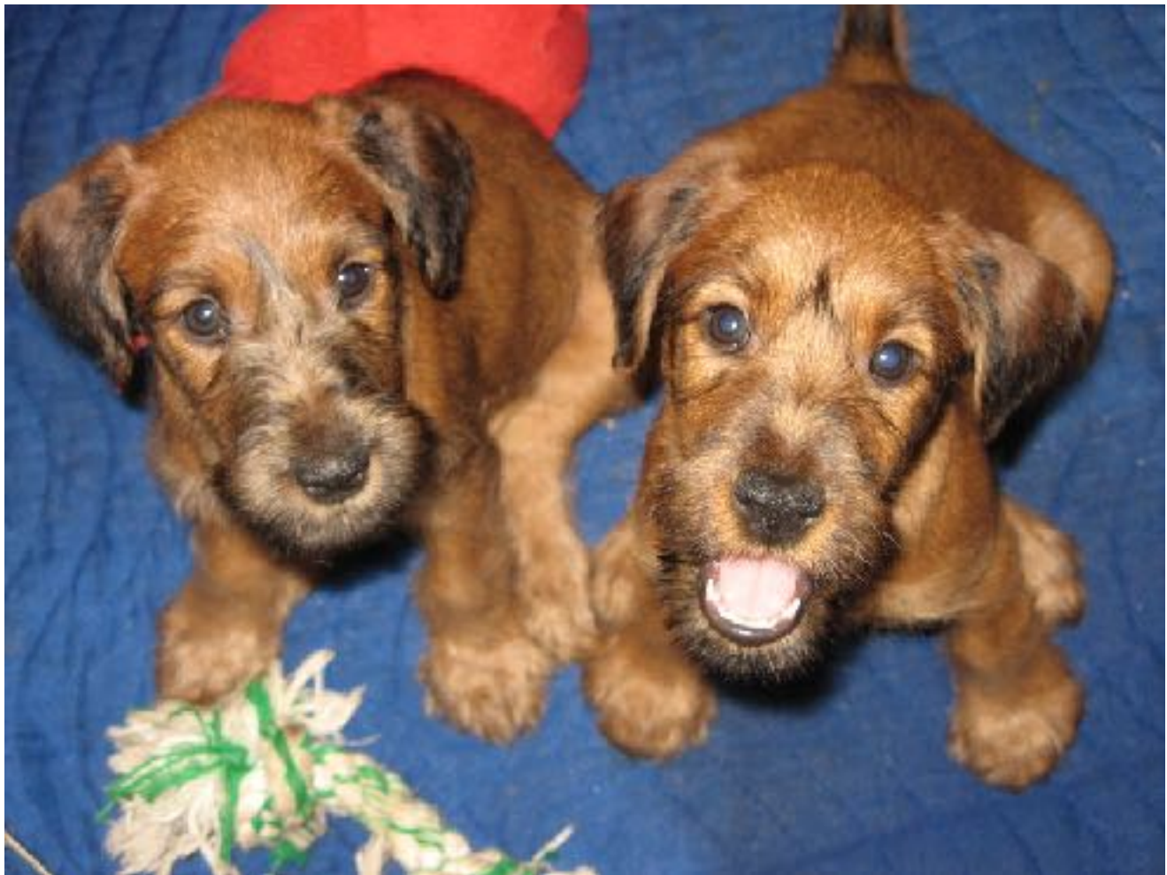
Fly & Keegan (aka Ch Kincora's Flight of Fancy & CH Kincora's Chelan Thunder)