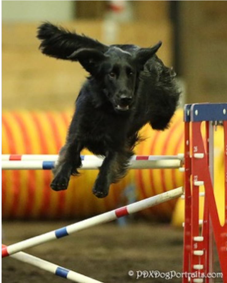
Look at her fly!