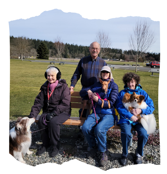
Our very first Fun Walk at Carrie Blake Park

Q3 | June 30, 2025 Q4 | September 15, 2025 Submit articles to info@hrkc.org