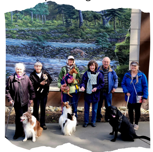
Second Fun Walk at the Railroad Bridge

They did suggest a few minor changes, and the membership will act on those at the April general membership meeting. We are close!